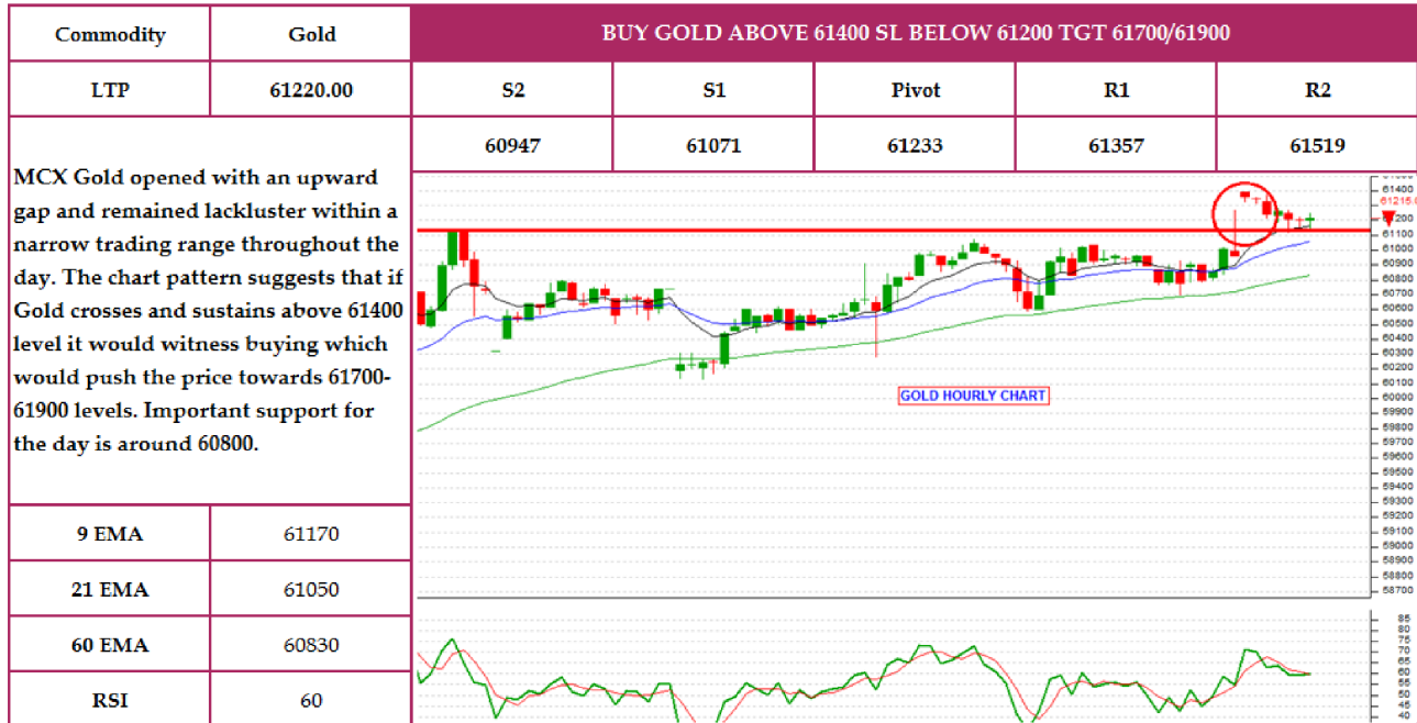
Chart for the day